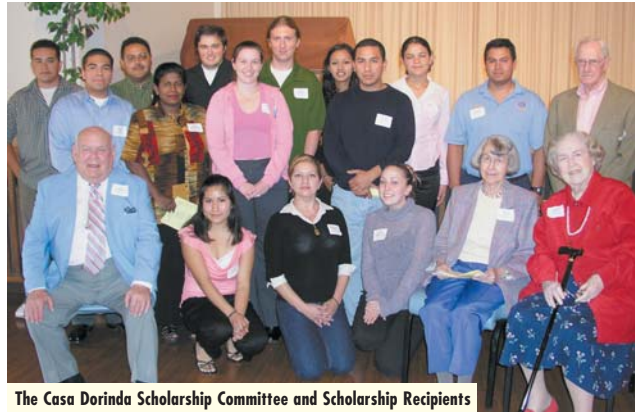
The Casa Dorinda Scholarship Committee and Scholarship Recipients